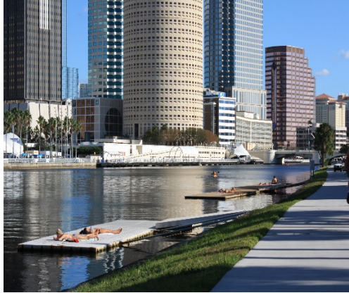
Img 1 : Bowery Bayside (South Tampa)